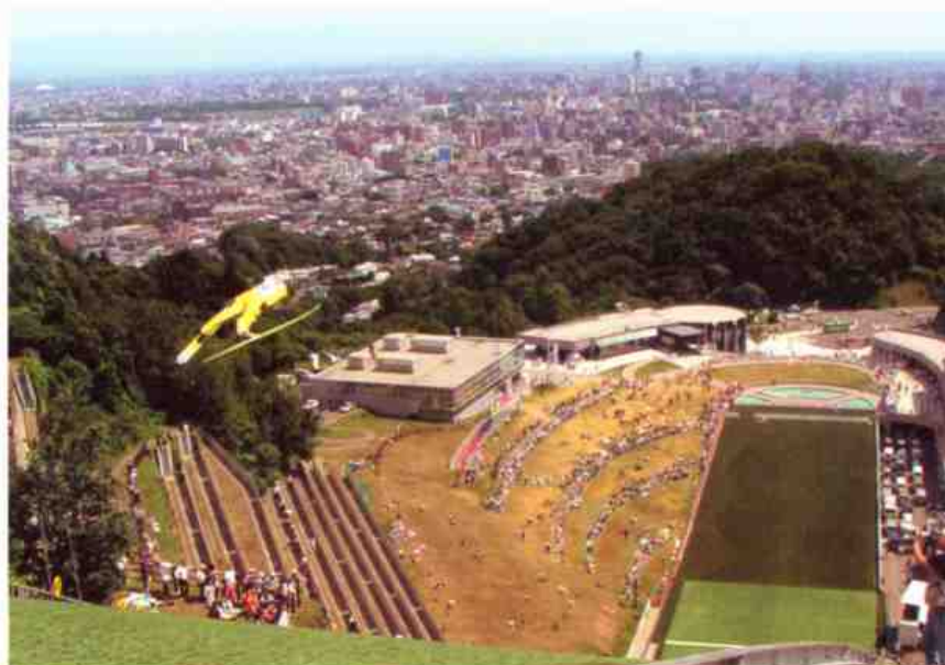
Midsummer ski jumping extends the winter sports season in Sapporo.