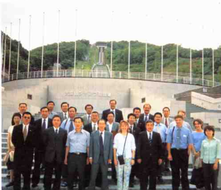
Officials attending the first working-level officials meeting pose under Okurayama Ski Jump in Sapporo.

Ulaanbaatar, Mongolia will host the next annual IAMNC working-level officials meeting.