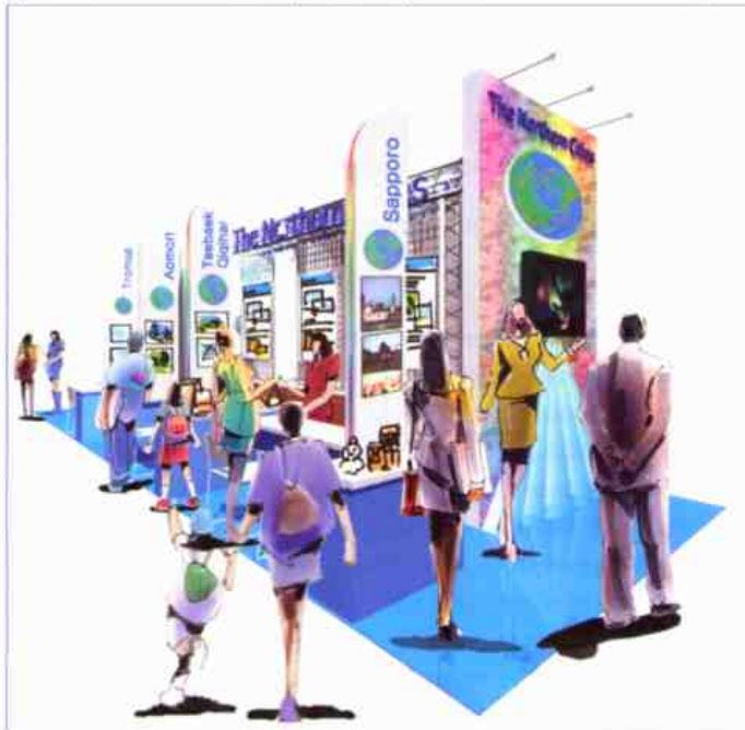
The IAMNC will promote its membership to the extensive Japanese travel market at the World Travel Fair 2002 in Yokohama.

The decision for the IAMNC to participate in the World Travel Fair 2002 was made at the tenth International Conference of Mayors of Northern Cities in Aomori, Japan last February as a step toward collaborative