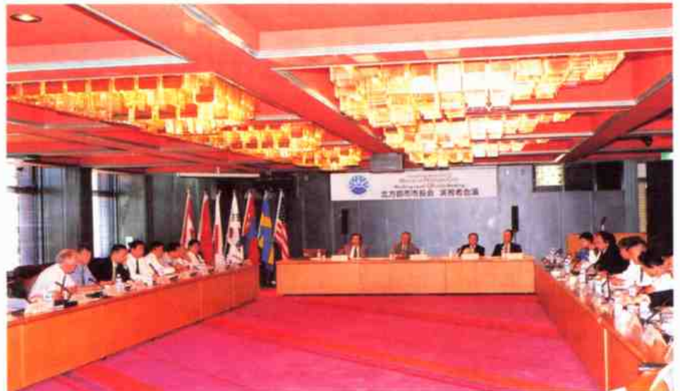
The working-level officials meeting convened at the Northern Regions Center in Sapporo.

At the meeting in Sapporo, site of the IAMNC secretariat, administrators from 23 cities exchanged and considered ideas and opinions on a variety of topics, including reconsideration of the geographic area from which the asso-