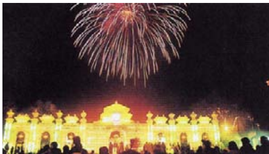
Qiqihar Snow and Ice Festival.

Qiqihar, which means “frontier” in the Daol language, was founded in 1692. The city prides