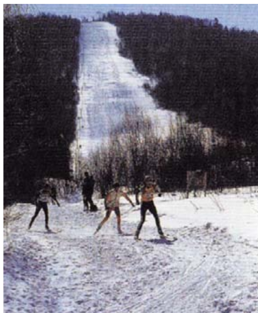
Skiers on the slopes near Jixi.

The ecologically and environmentally superior Jixi is blessed with vast expanses of arable land, lakes, wetlands, natural preserves, forests, fertile land, blue skies, and