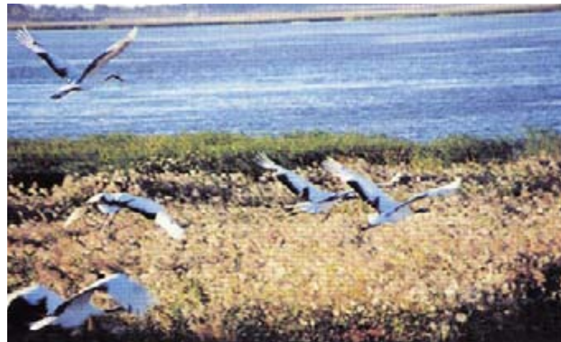
Cranes at the Zhalong Nature Preserve.

itself on a history that dates back more than 300 years.