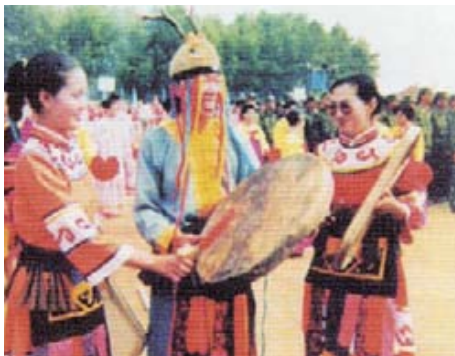
Hezhe Ethnic Tour.

Jiamusi also has plans for a Dalianhe Primitive Forests Tour, a Three River Plains Agricultural Tour, and a Wofoshan Ski Tour.