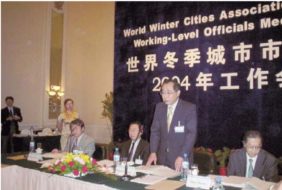
The WWCAM Working-Level Officials Meeting 2004 was opened in Changchun, China.