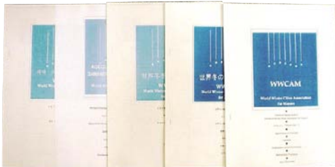
WWCAM in five languages.

The WWCAM information packet that introduces the association's activities has been newly compiled in five