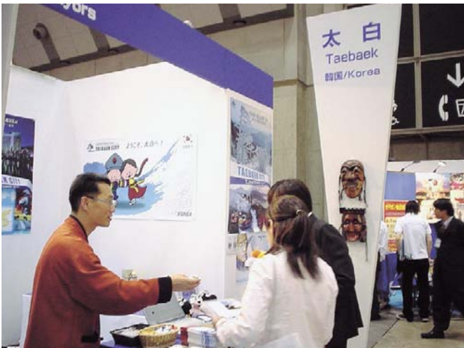
Taebaek, South Korea

The 2004 World Travel Fair attracted over a hundred thousand visitors to Tokyo Big Sight exhibition hall during the three-day event. This is an important market for WWCAM cities, as international travel and tourism remains a popular pastime for many Japanese.