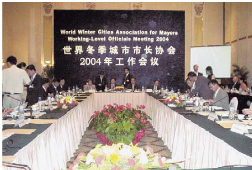
WWCAM city officials from ten cities representing six countries met in Changchun.