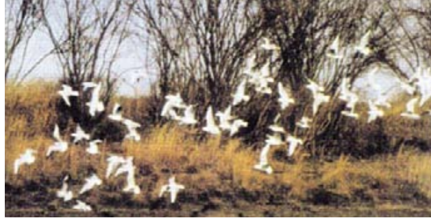
Birds returning to the Sanjiang Wetland Sanctuary.

The city of Jiamusi has initiated a vigorous tourism promotion campaign with five projects and a goal to attract over five hundred thousand domestic and foreign tourists every year. Two of the projects are a Frontier River Tour, and a Hezhe Tour.