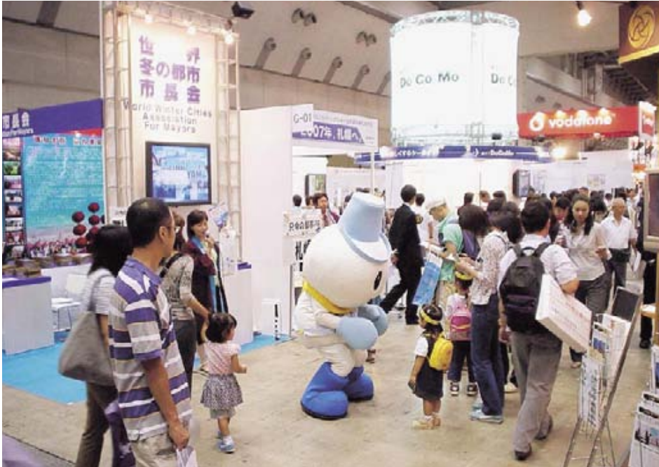
WWCAM Winter Cities attracted crowds at the 2004 JATA World Travel Fair.