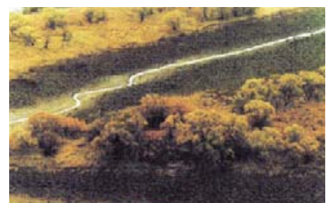
Xingkai Lake Marshland.

Jixi is also famous for its more than 120 historical and natural attractions, where sightseers can enjoy awe-inspiring scenery. The revenue obtained from tourism in Jixi is increasing steadily.