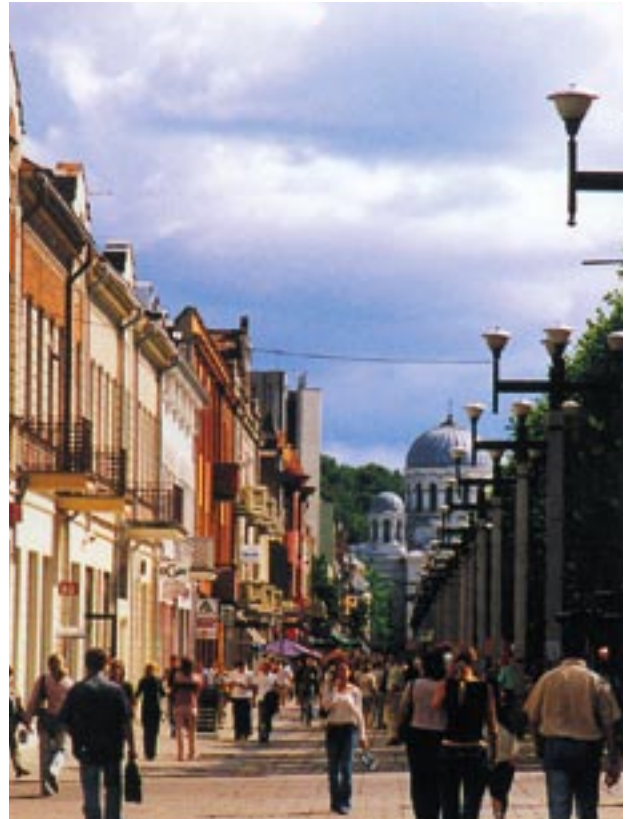
Street scene in Kaunas.

Location: 54° N. Latitude, 23° E. Longitude