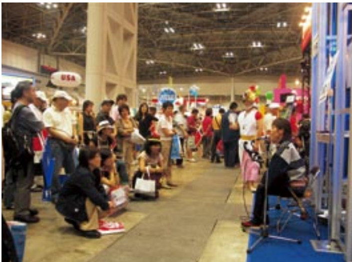
Musicians entertained World Travel Fair visitors.