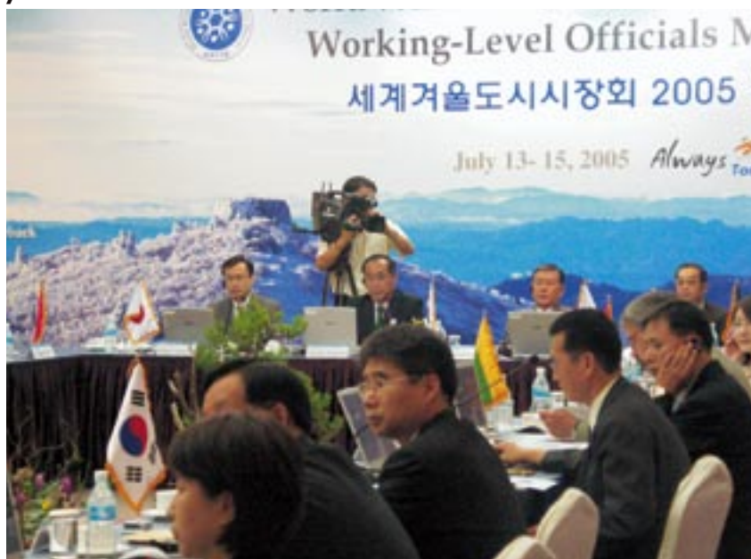
The Mayors Conference in Changchun was discussed at the meeting.

At the WWCAM working-level officials meeting, representatives from Changchun also discussed requirements for participation in the Winter Expo and the Winter Cities Forum, which will be held in conjunction with the Mayors Conference.