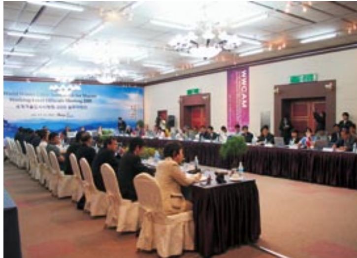
Working-Level Officials meet in Taebaek, South Korea.

The twelfth biennial Mayors Conference is planned for January 15 through 18, 2006 in Changchun, China, and officials from Changchun discussed the overall theme of the conference, "Grow in Winter," in addition to other topics. The following have been identified as topics for discussion at the upcoming conference in January.