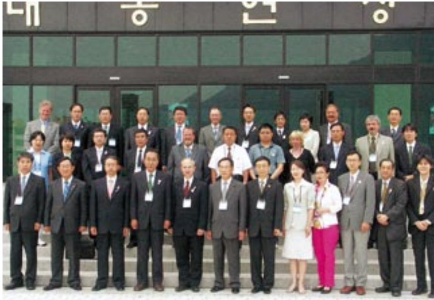
City officials from Mongolia, Japan, China, Korea, Russia, Norway, Greenland, and the United States pose in Taebaek, Korea.

Taebaek and Chuncheon, Korea; Kaunas, Lithuania; Ulaanbaatar, Mongolia; Tromsø, Norway; and Anchorage, USA.