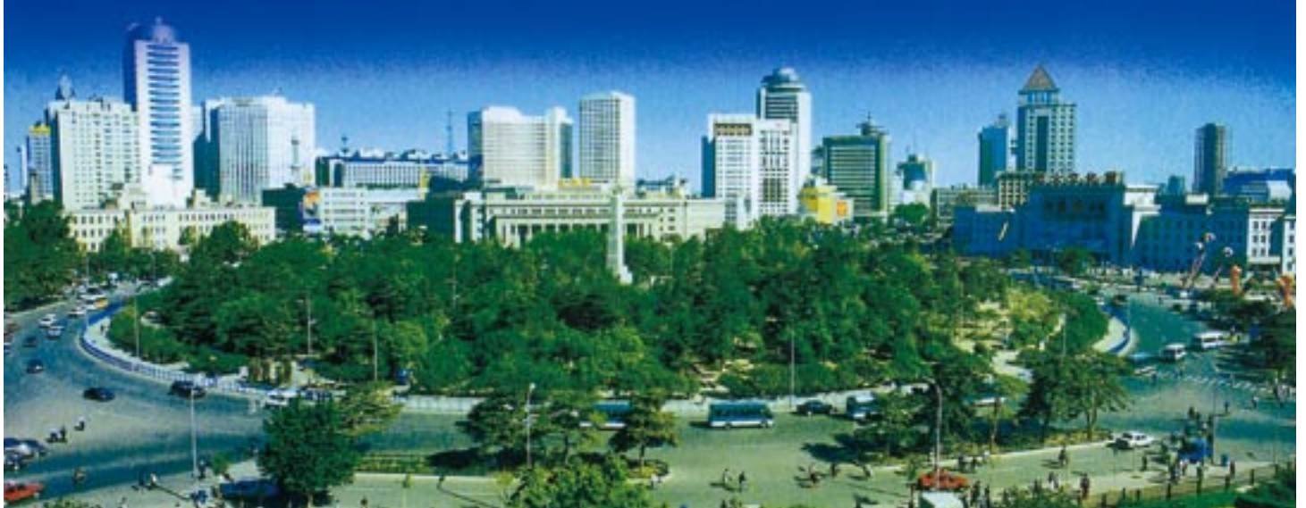
Changchun, China, site of the twelfth biennial WWCAM Mayors Conference, January 15 to 18, 2006.