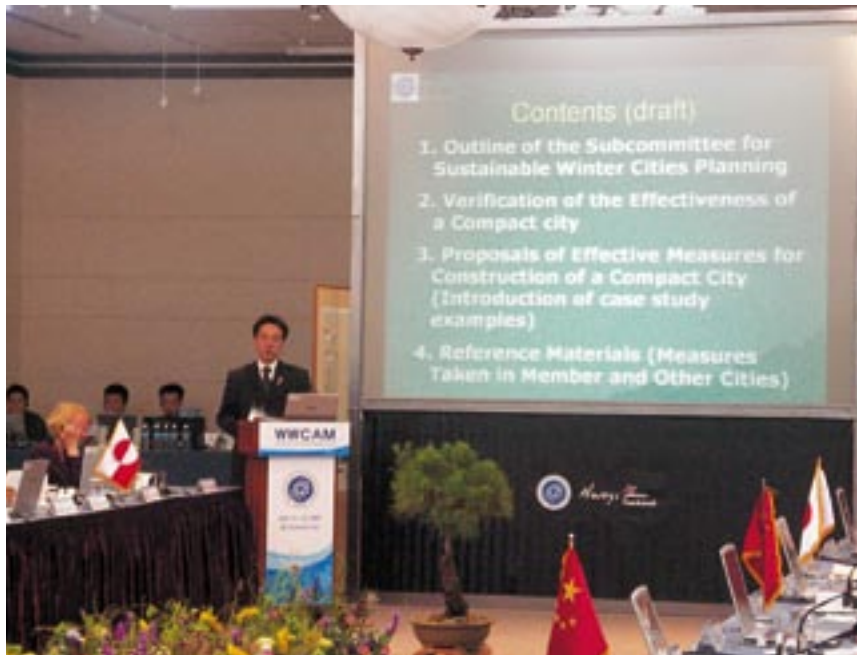
A discussion on winter cities planning in Taebaek: one of many presentations at the Working-Level Officials Meeting.

Cities represented at the working-level meeting were Changchun, Qiqihar, and Shenyang, China; Nuuk, Greenland; Aomori and Sapporo, Japan;