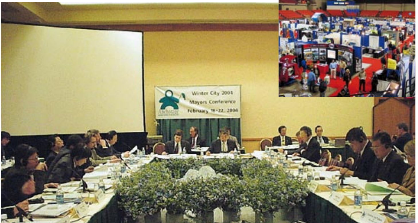
Eleventh Mayors Conference and the Winter Expo (inset) in Anchorage, Alaska, in 2004.

For registration details, please refer to the city of Changchun's homepage: < http://www.ccfao.com.cn/wwcam/index014.html >.