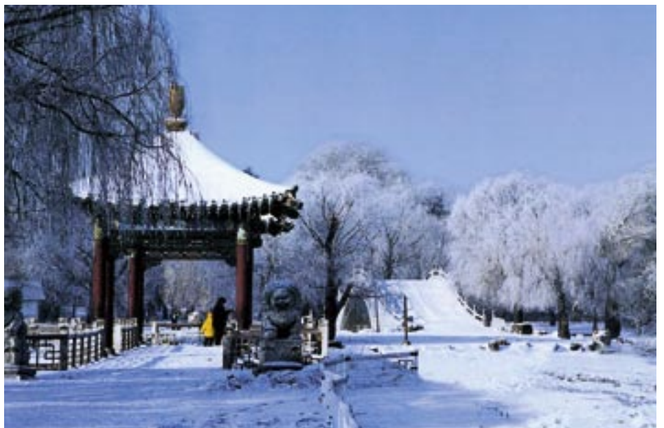
Idyllic winter scenery in Changchun.

technology and business exchanges will take place at the Winter Expo. Academic researchers and specialists on civic life and urban development in winter cities will exchange ideas and opinions during the Winter Cities Forum. The Winter Expo and Winter Cities Forum will be held concurrently with the Mayors Conference.