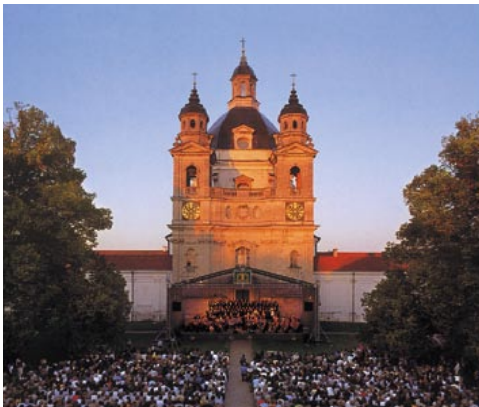
Open-air concert in Kaunas.