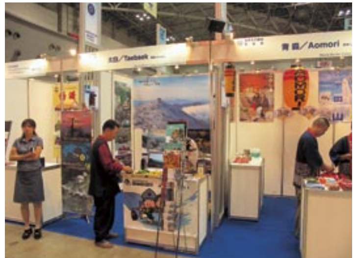
Taebaek and Aomori booths.