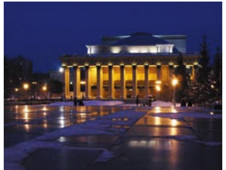
Novosibirsk State Opera and Ballet Theatre.

mosphere of the city has become brighter.