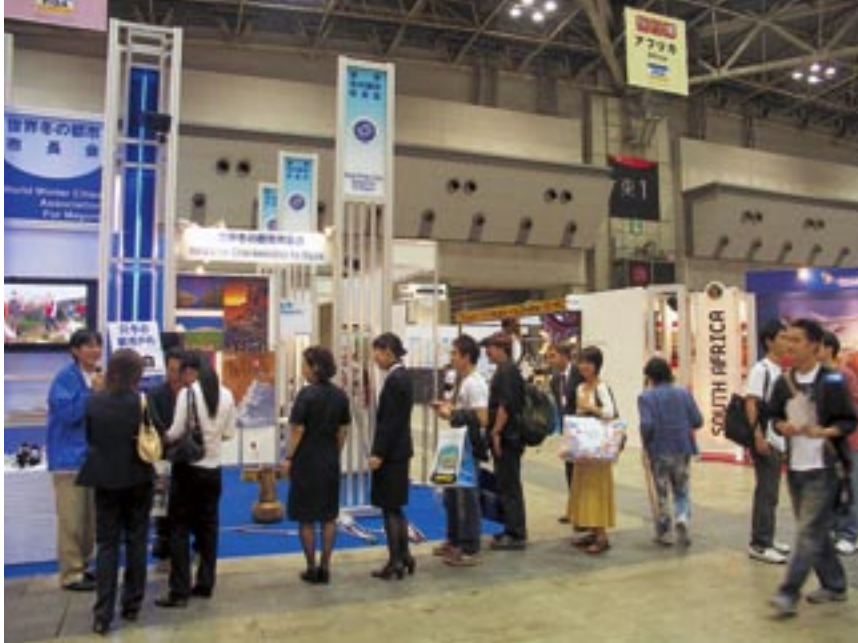
WWCAM display at the World Travel Fair in Tokyo.

Beautiful Winter The Aurora Borealis of the winter sky, beautiful sculptures of ice and snow, festivals celebrating the joy of winter, cool and refreshing