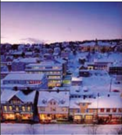
WWCAM member Tromsø, Norway.