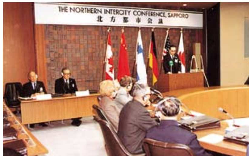
First Mayors Conference, Sapporo, 1982.

The host city of a Mayors Conference may organize a Winter Expo and a Winter Cities Forum in conjunction with the conference. The host city, along with businesses and organizations of member cities, realizes an exhibition of a range of winter-related products at the Winter Expo.