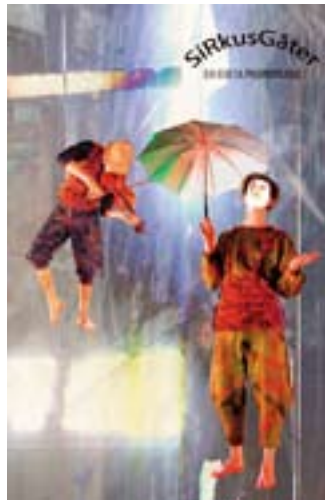
Tromsø circus performers.

The Tromsø delegation comprised a large group of musicians, circus performers, and representatives of the tourism industry led by the mayor of Tromsø. The musicians and circus performers demonstrated their talents at Odori Park in the center of Sapporo and at the children's theater, Yamabikoza, to