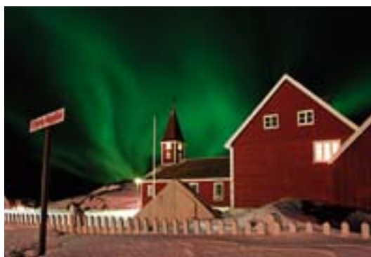
"Northern Lights" photographed by Carsten Egevang (Source: Greenland Tourism)

The city of Nuuk is planning an exciting array of Greenlandic experiences in a variety of cultural events, such as theatre, concerts, and a Culture Night. For the technical tours, it will be possible to ride a snowmo-