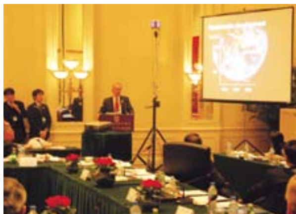
Winter environmental issues were topics in Changchun.

The next Mayors Conference will be held in Greenland, where the impact of global warming is serious. Also, the WWCAM will continue to study environmental concerns, respecting the ideals of the Changchun Declaration and sharing wisdom and expertise.