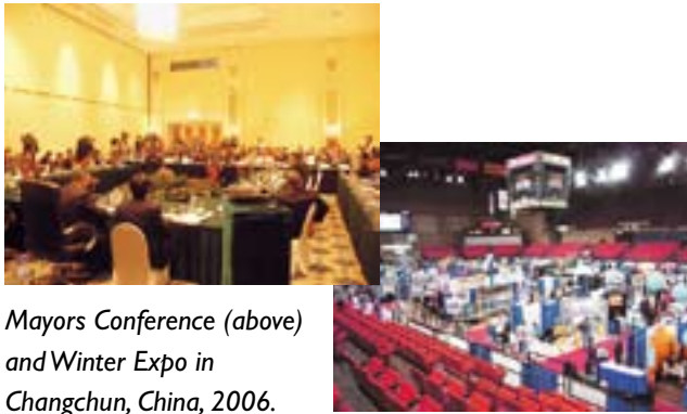
Mayors Conference (above) and Winter Expo in Changchun, China, 2006.

The addition of the Winter Expo and the Winter Cities Forum to the World Winter Cities Conference for Mayors has greatly increased the scale and significance of the conference.