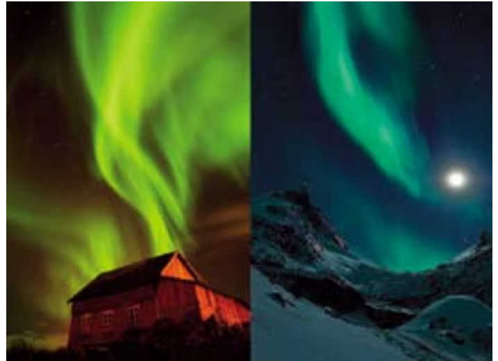
Aurora Borealis is one of Tromsø's major tourist attractions.

From World Winter Cities Association for Mayors Secretariat c/o City of Sapporo 060-8611 JAPAN