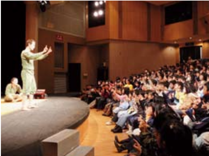
Members of Kultra, a circus from Tromsø, entertain children.

The cities of Sapporo and Tromsø have been engaged in a range of exchange activities since 1988 through the Winter Cities Association for Mayors, and the strong friendship between these two winter cities fostered through many years of exchanges made this event a success.