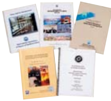
WWCAM subcommittee reports.

The WWCAM subcommittees conduct research and case studies and exchange information on winter technology. The subcommittees for “Waste Reduction and Recycling,” “Winter Recreation and Tourism,” “Sustainable Winter Cities Planning,” and “Measures Against Terrorism in Northern Cities” are examples of WWCAM subcommittees that have compiled research reports.