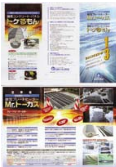
Mr. Tokasu brochure.

The Group has applied for a patent for Mr. Tokasu, which has been approved as a new business product by national, prefectural, and municipal governments.