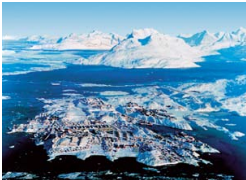
Nuuk, Greenland, site of the 13th Mayors Conference in January 2008.

13th Mayors Conference Will Tackle Global Warming