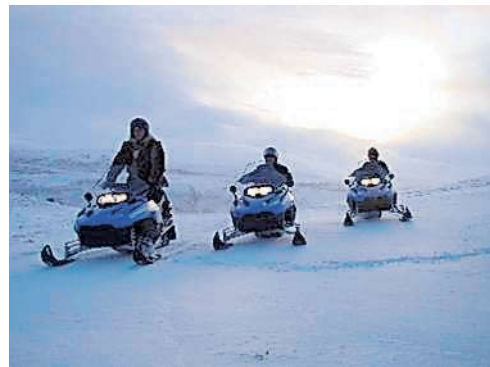
Snowmobilers enjoy winter in Nuuk.

the world. The fjord is never iced over and is navigable all year round. The fjords and mountains offer visitors a unique experience and form