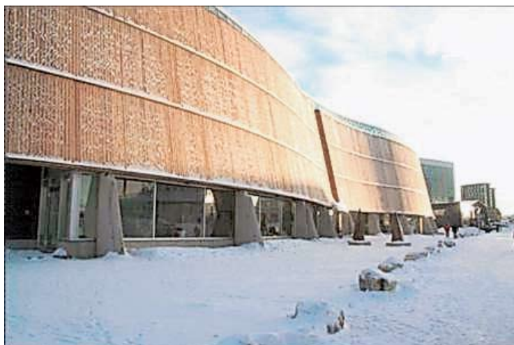
Katuaq Culture Centre, site of the 2008 Mayors Conference.

E-mail questions about the WWCAM to the Secretariat at < wwcam@city.sapporo.jp >, or visit the association's website at < www.city.sapporo.jp/somu/wwcam/ > for information.