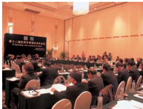
WWCAM members meet at the 2006 Mayors Conference in Changchun, China.