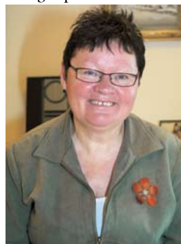
Mayor Agnethe Davidsen

Agnethe Davidsen, Mayor of Nuuk, Greenland