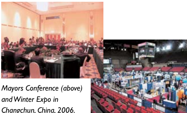
Mayors Conference (above) and Winter Expo in Changchun, China, 2006.

The addition of the Winter Expo and the Winter Cities Forum to the World Winter Cities Conference for Mayors has greatly increased the scale and significance of the conference.