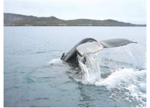
Whale watching attracts tourists to Nuuk.

the basis for the city's leisure activities, including sailing, hunting, fishing, and hiking. Long-distance and alpine skiing, snow scootering, and ice skating are