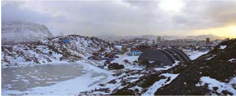
Inussivik Multipurpose Hall, site of Winter Expo January 19–20

Godthåbfjord is approximately 100 kilometers long and is one of the greatest fjord systems in