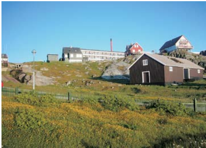
Summer is also a beautiful season in Greenland.

In the council meeting room at the Town Hall, there is a special attraction. The hall is decorated with thirteen tapestries with motifs from paintings by the famous Greenland artist, politician, and social activist, Hans Lynge (1906 - 1988). The tapestries were woven by Danish artists using Greenlandic wool and plant colors from Greenland's fauna. Greenland is full of attractions for visitors!