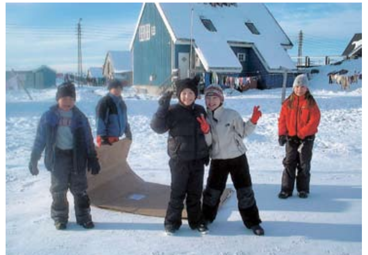
Snow is the playmate of young Greenlanders.