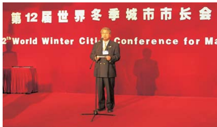
Fumio UEDA, WWCAM President and Mayor of Sapporo, speaking at the Opening Ceremony of the 2006 Mayors Conference in Changchun, China.

The host city of a Mayors Conference may organize a Winter Expo and a Winter Cities Forum in conjunction with the conference. The host city, along with businesses and organizations of member cities, realizes an exhibition of a range of winter-related products at the Winter Expo.