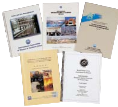
WWCAM subcommittee reports.

The WWCAM subcommittees conduct research and case studies and exchange information on winter technology. The subcommittees for “Waste Reduction and Recycling,” “Winter Recreation and Tourism,” “Sustainable Winter Cities Planning,” and “Measures Against Terrorism in Northern Cities” are examples of WWCAM subcommittees that have compiled research reports.