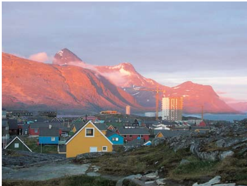
Nuuk, Greenland, site of the 13th Mayors Conference in January 2008.