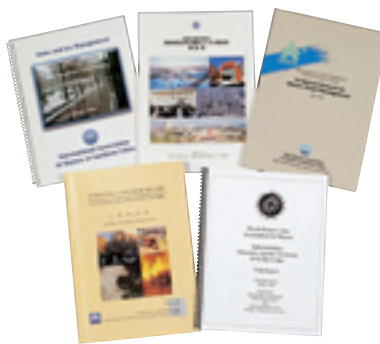
WWCAM subcommittee reports.

The WWCAM subcommittees conduct research and case studies and exchange information on winter technology. The subcommittees for “Waste Reduction and Recycling,” “Winter Recreation and Tourism,” “Sustainable Winter Cities Planning,” and “Winter City Environmental Issues” are examples of WWCAM subcommittees that have compiled research reports.