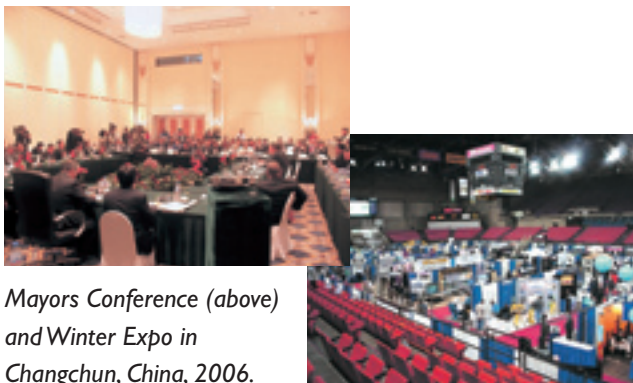
Mayors Conference (above) and Winter Expo in Changchun, China, 2006.

The addition of the Winter Expo and the Winter Cities Forum to the World Winter Cities Conference for Mayors has greatly increased the scale and significance of the conference.