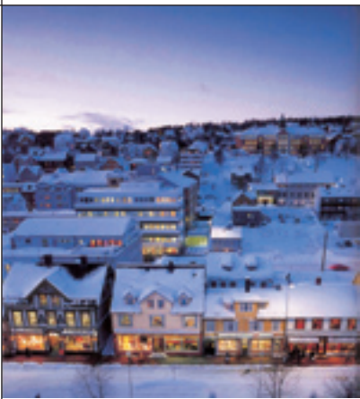
WWCAM member Tromsø, Norway.