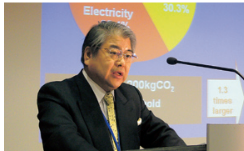
Mayor Ueda makes a presentation on Sapporo's environmental issues at the Maardu Mayors Conference in January 2010.

The host city of a Mayors Conference may organize a Winter Expo and a Winter Cities Forum in conjunction with the conference. The host city, along with businesses and organizations of member cities, realizes an exhibition of a range of winter-related products at the Winter Expo.