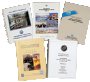
WWCAM subcommittee reports.

The WWCAM subcommittees conduct research and case studies and exchange information on winter technology. The subcommittees for “Waste Reduction and Recycling,” “Winter Recreation and Tourism,” “Sustainable Winter Cities Planning,” and “Winter City Environmental Issues” are examples of WWCAM subcommittees that have compiled research reports.