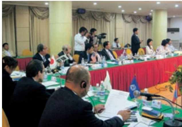
Participants enthusiastically exchanged opinions at the WLOM in Ulaanbaatar.