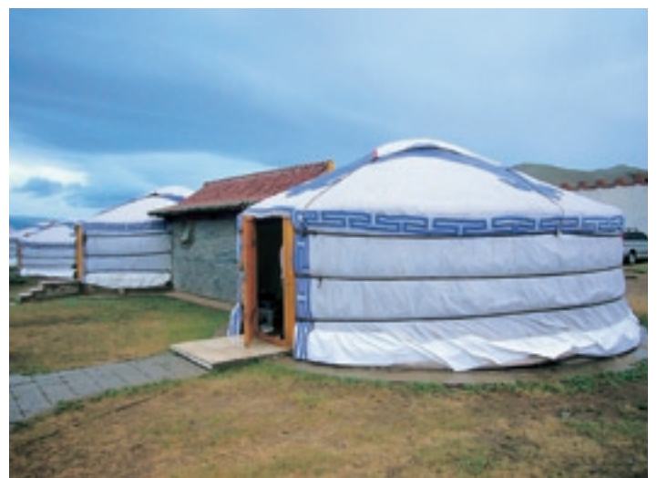
The traditional Mongolian Ger residences are common outside cities and towns.