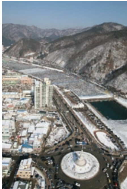
A view of Hwacheon during the Sancheoneo Ice Festival.

The exhibition is not the first effort by Hwacheon to promote and publicize WWCAM work. The project characterizes Hwacheon's interest and participation in the association since it became a WWCAM member in July of 2008.