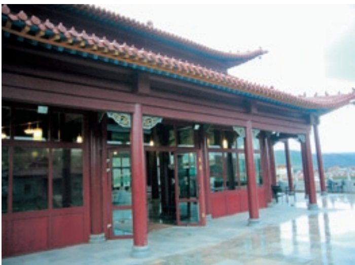
A restaurant featuring traditional Mongolian architecture adds cultural class to meals.

“We hope to learn from member cities that might have faced similar challenges 20 or 30 years ago,” the vice mayor said.