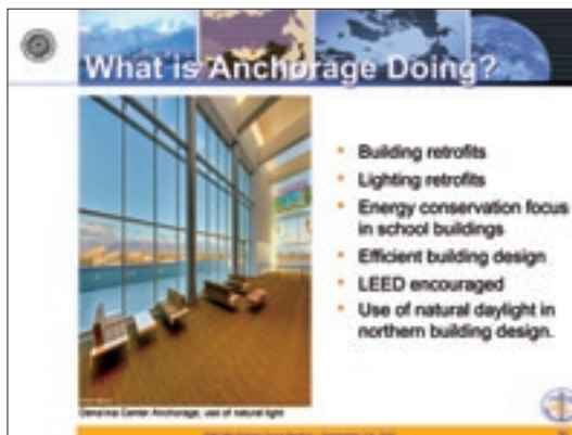
Anchorage works toward sustainability.

Also, two major local research institutes, the Chang-