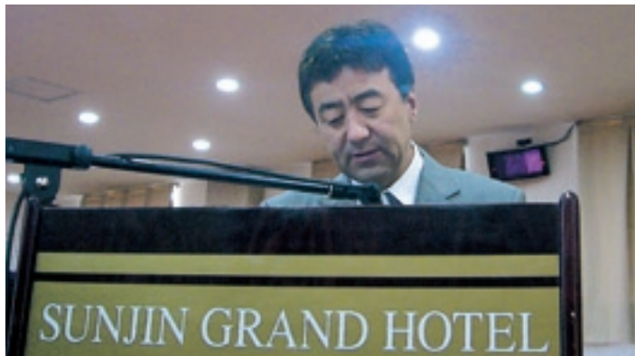
Munkhbayar Gombosuren, mayor of Ulaanbaatar, presented the plan for the fifteenth Mayors Conference.