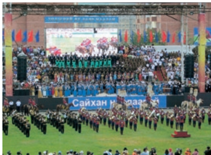
The Naadam Festival in Ulaanbaatar takes place during summer holidays in July.