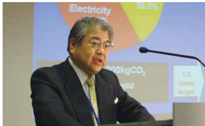
Mayor Ueda makes a presentation on Sapporo's environmental issues at the Maardu Mayors Conference in January 2010.

The host city of a Mayors Conference may organize a Winter Expo and a Winter Cities Forum in conjunction with the conference. The host city, along with businesses and organizations of member cities, realizes an exhibition of a range of winter-related products at the Winter Expo.