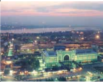
WWCAM member Novosibirsk, Russia.