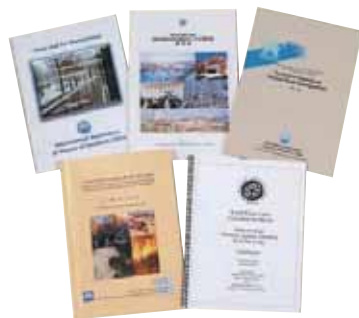
WWCAM subcommittee reports.

The WWCAM subcommittees conduct research and case studies and exchange information on winter technology. The subcommittees for “Waste Reduction and Recycling,” “Winter Recreation and Tourism,” “Sustainable Winter Cities Planning,” and “Winter City Environmental Issues” are examples of WWCAM subcommittees that have compiled research reports.