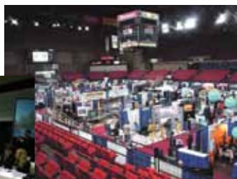
Winter Expo in Anchorage, U.S.A., 2004.

Working-Level Officials Meetings allow senior administrators of WWCAM member cities to meet and discuss the themes of upcoming Mayors Conferences, as well as important matters related to the management of future conferences.