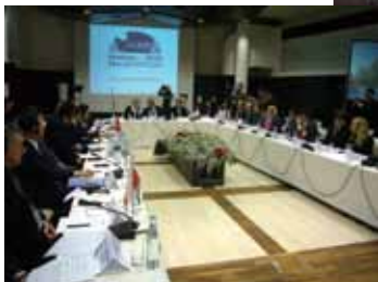
Mayors Conference in Maardu, Estonia, 2010.

The addition of the Winter Expo and the Winter Cities Forum to the World Winter Cities Conference for Mayors has greatly increased the scale and significance of the conference.