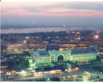
WWCAM member Novosibirsk, Russia.