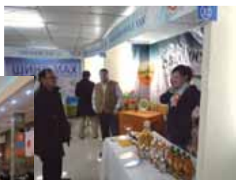
Winter Expo in Ulaanbaatar, Mongolia, 2012.