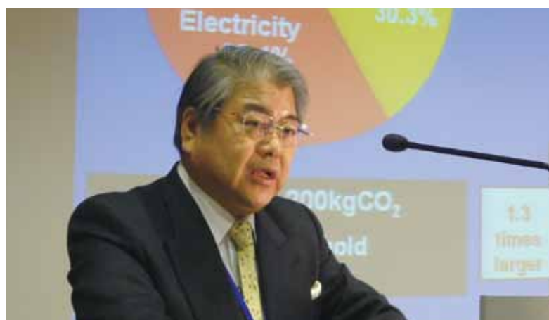
Mayor Ueda makes a presentation on Sapporo's environmental issues.

The host city of a Mayors Conference may organize a Winter Expo and a Winter Cities Forum in conjunction with the conference. The host city, along with businesses and organizations of member cities, realizes an exhibition of a range of winter-related products at the Winter Expo.