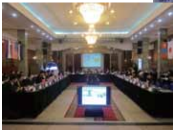
Mayors Conference in Ulaanbaatar, Mongolia, 2012.

The addition of the Winter Expo and the Winter Cities Forum to the World Winter Cities Conference for Mayors has greatly increased the scale and significance of the conference.