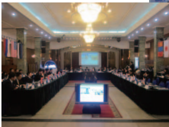
Mayors Conference in Ulaanbaatar, Mongolia, 2012.

The addition of the Winter Expo and the Winter Cities Forum to the World Winter Cities Conference for Mayors has greatly increased the scale and significance of the conference.