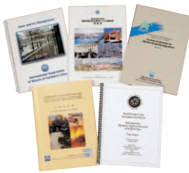
WWCAM subcommittee reports.

The WWCAM subcommittees conduct research and case studies and exchange information on winter technology. The subcommittees for “Waste Reduction and Recycling,” “Winter Recreation and Tourism,” “Sustainable Winter Cities Planning,” and “Winter City Environmental Issues” are examples of WWCAM subcommittees that have compiled research reports.