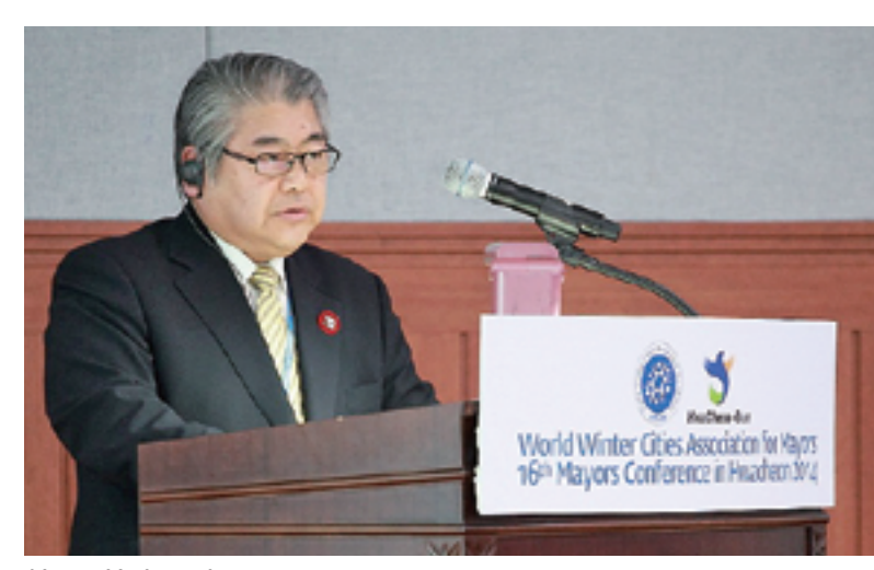
Mayor Ueda makes a presentation on winter-city issues.

The host city of a Mayors Conference may organize a Winter Expo and a Winter Cities Forum in conjunction with the conference. The host city, along with businesses and organizations of member cities, realizes an exhibition of a range of winter-related products at the Winter Expo.