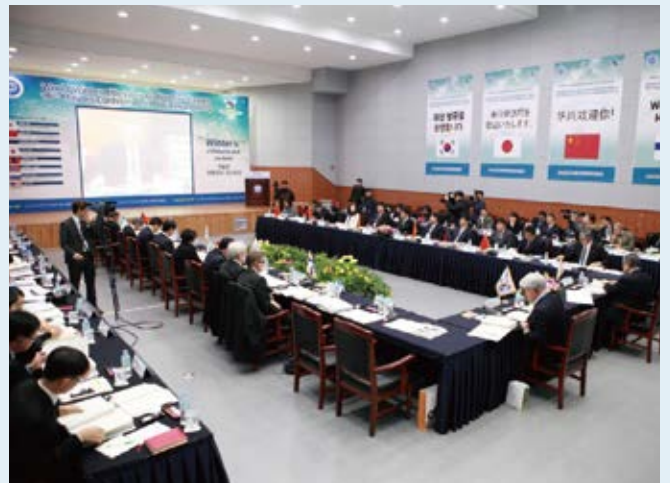
WWCAM representatives from twelve member cities of four countries confer at the sixteenth Mayors Conference in Hwacheon, Republic of Korea, in January 2014.

The WWCAM invites you to join us to make winter cities more livable. Please contact us for more details on membership and registration. The World Winter Cities Association for Mayors Secretariat (Tel: 81-11-211-2032; Fax: 81-11-218-5168; E-mail: wwcam@city.sapporo.jp ).