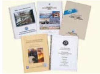
WWCAM subcommittee reports.

The WWCAM subcommittees conduct research and case studies and exchange information on winter technology. The subcommittees for “Winter Recreation and Tourism,” “Snow Management,” “Countermeasures Against Natural Disasters,” “Sustainable Winter Cities Planning,” and “Environmental Protection” are examples of WWCAM subcommittees that have compiled research reports. For more information, please visit the WWCAM website.