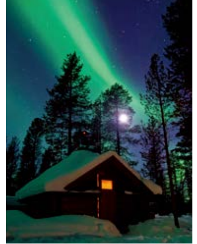
WWCAM member Rovaniemi, Finland

Working-Level Officials Meetings allow senior administrators of WWCAM cities to meet and discuss the themes of upcoming Mayors Conferences and matters related to the management of future conferences. The meeting is to be held biennially in Sapporo, WWCAM’s secretariat city.