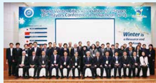
2014 Hwacheon Mayors Conference

On the theme of urban development in winter cities, member cities will discuss city planning that makes use of the unique climatic traits of winter cities at the 2016 Mayors Conference. The association will additionally continue to discuss solutions to environmental issues, as agreed upon in the Hwacheon Declaration announced at the 2014 Hwacheon Mayors Conference.