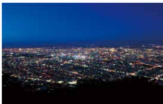
Night view from atop Mt. Moiwa – ranked one of Japan's new top three night views