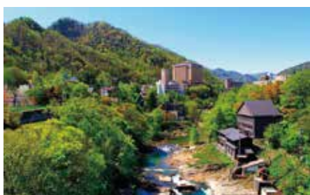
Sapporo's "annex" Jozankei Hot Spring District