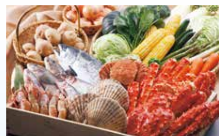
Sapporo – a culinary center for Hokkaido