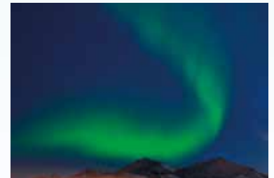
Aurora in Anchorage, U.S.A