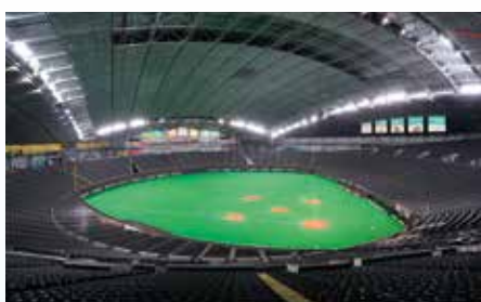
Sapporo Dome – an all-weather sports facility