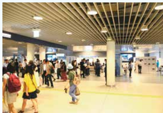
Sapporo Ekimae-dori Underground Walkway "Chi-ka-ho"

This expo will serve as a means for member cities from around the world to display and sell specialty goods from their regions to Sapporo residents. The tentative venue for this expo is an underground passageway spanning the city center which sees a large volume of traffic.