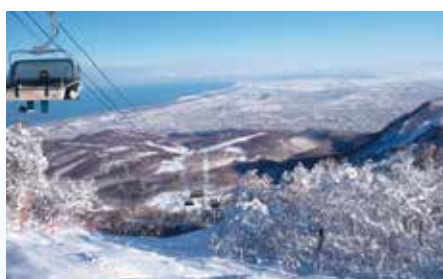
Offering the great thrill of winter sports