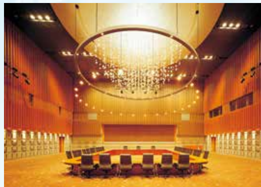
Sapporo Convention Center Special Conference Hall

Sub-themes: 1. Urban development arising from overcoming winter challenges; 2. Urban development utilizing winter; 3. Urban development that takes advantage of special climate features outside the winter season; 4. Eco-conscious sustainable urban development in winter cities.