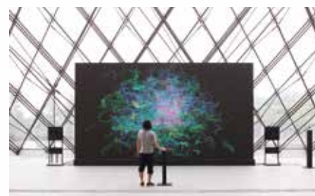
Sapporo International Art Festival 2014