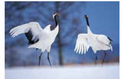
Cranes in Qiqihar, China