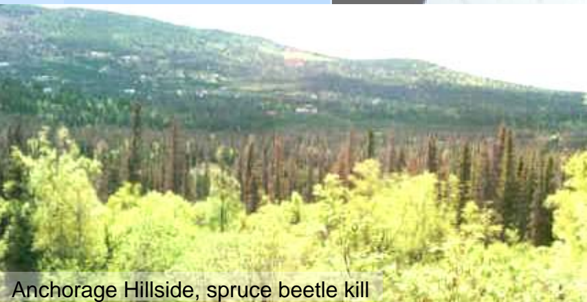
Anchorage Hillside, spruce beetle kill