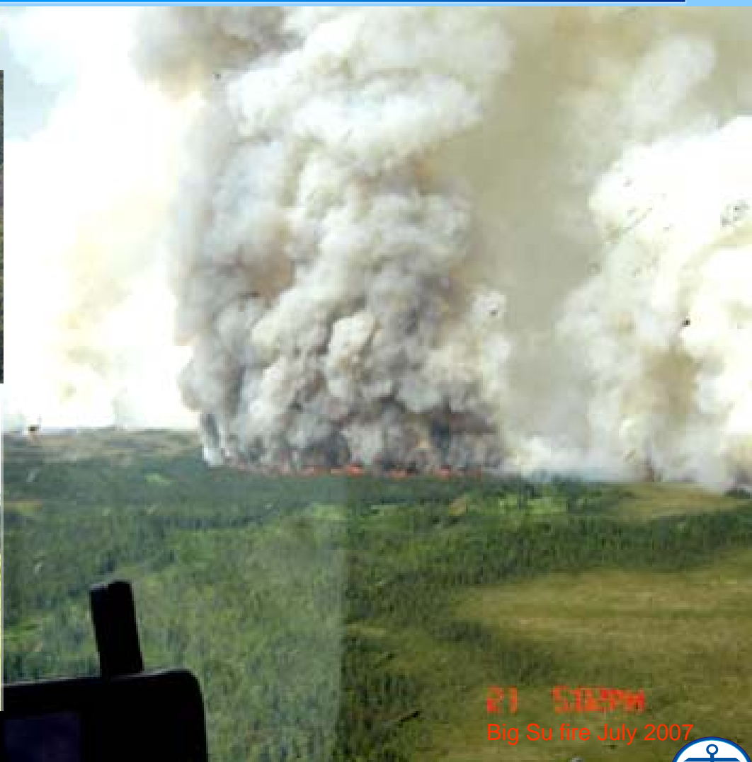
21 5:00 PM Big Su fire July 2007