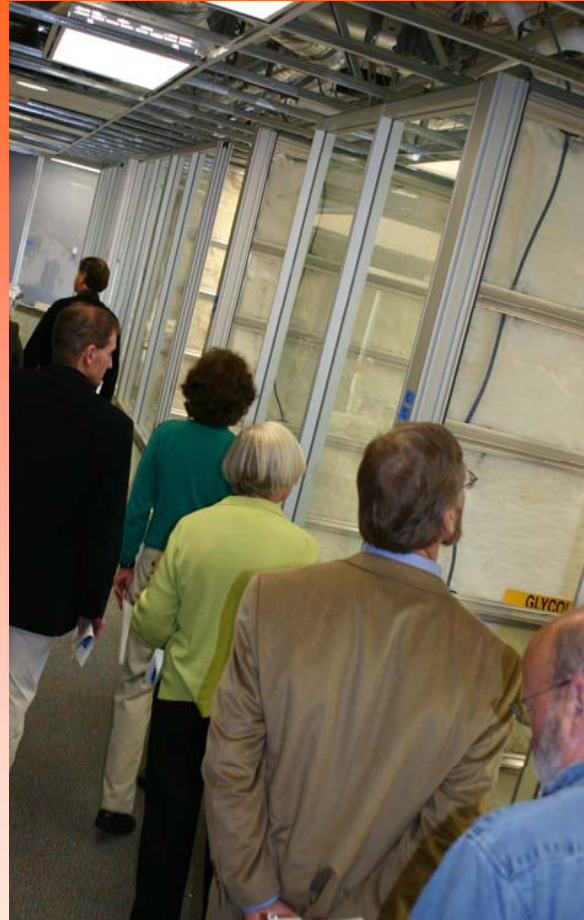
Tour of the DIRT wall systems at Sadler's Building.