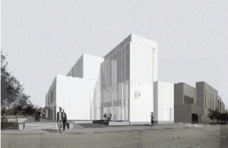
Drawing of the Anchorage Museum expansion.