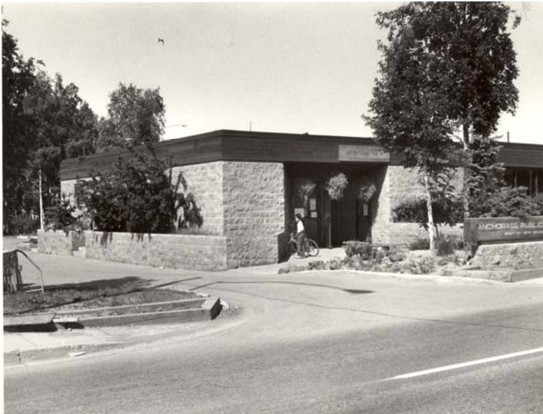
The soon-to-be renovated Mountain View Library.