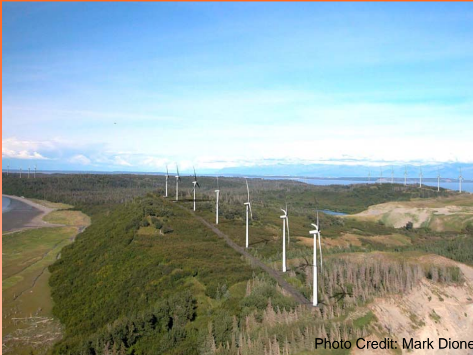
Chugach Electric Simulation of Wind Turbines on Fire Island